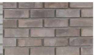
Selkirk - Contemporary Brick Brownstone