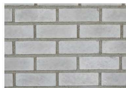
Selkirk - Contemporary Brick Bisque